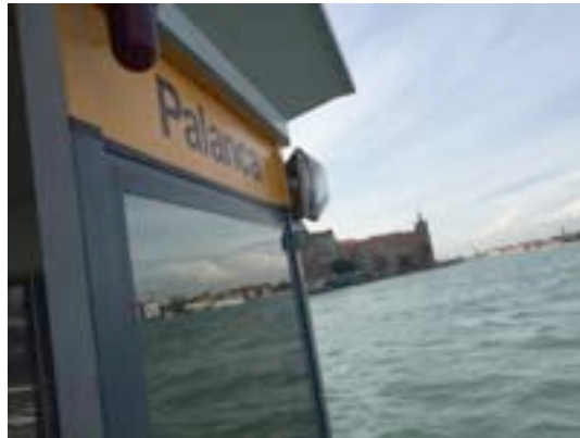
Stazione del Vaporetto, Palanca on the island of Giudecca

Remember to buy the ticket of the Vaporetto in some shops.