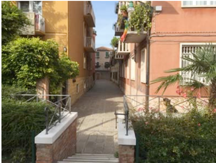
Calle Bevilacqua from the Harbour of Canale della Giudecca