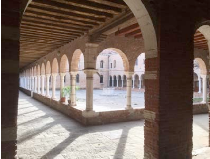
Ex Convento-Monastery di San Cosimo e Damiano