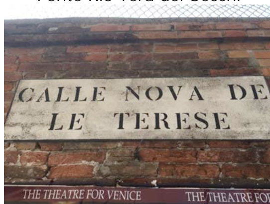
Street to Campo San Nicoló dei Mendicoli