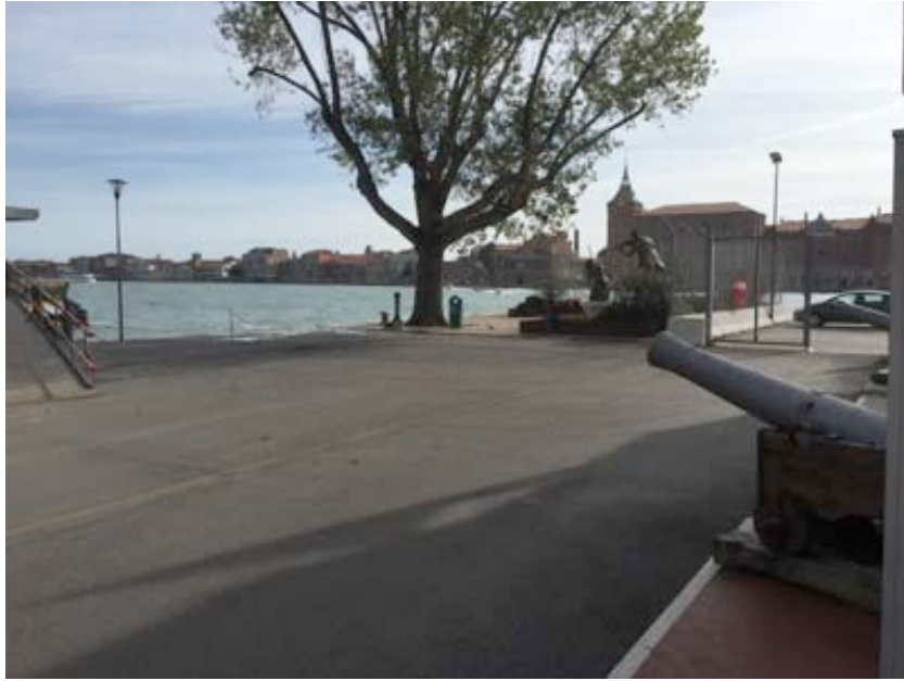
Campo San Basegio