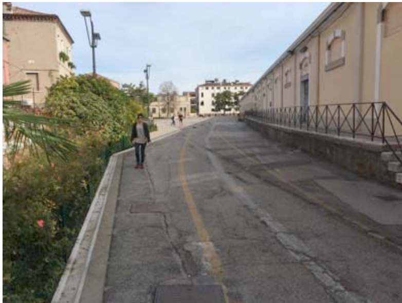
Salizzata San Basegio to the Harbour of Canale della Giudecca