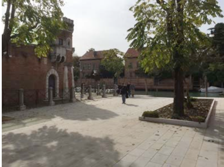
Rio Terá dei Pensieri