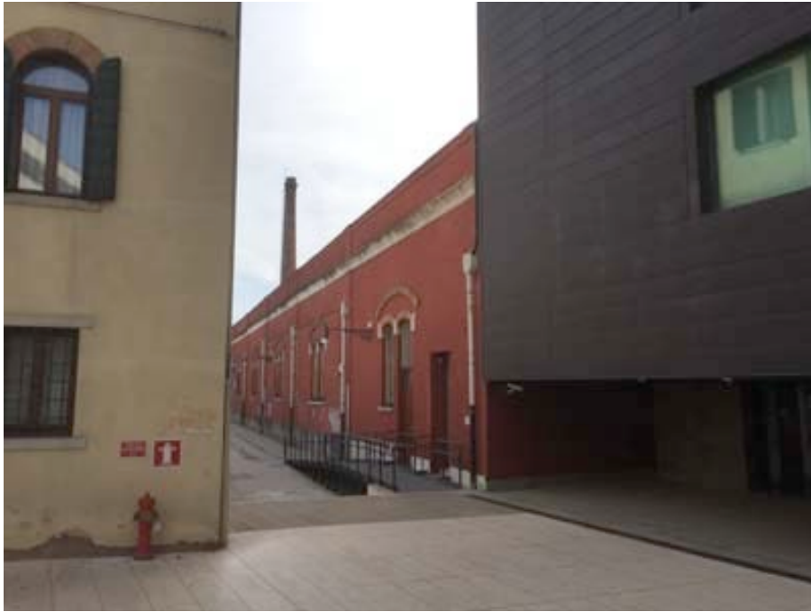
Calle Nuova dei Tabacchi