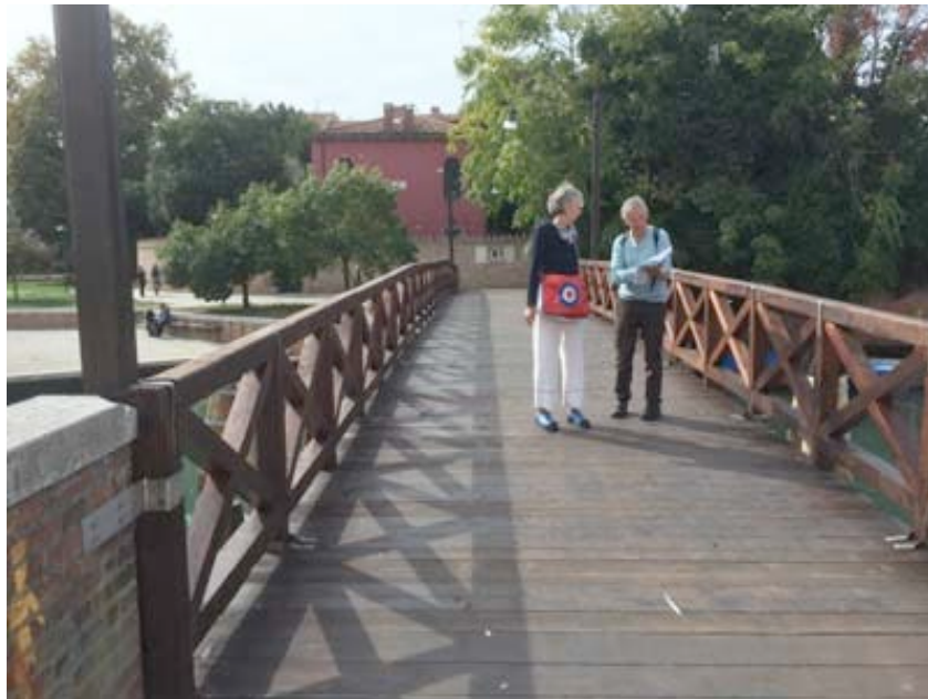
Ponte Rio Terá dei Secchi