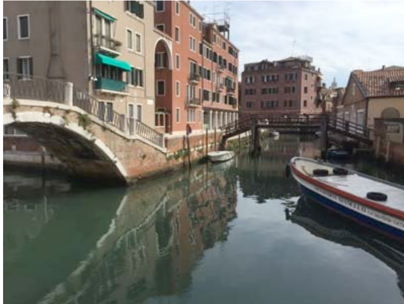
Ponte from C.S.Maria Maggiore to Fondamenta della Madonna