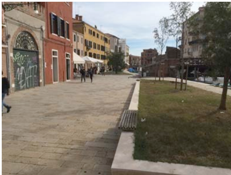
Fondamenta della Madonna