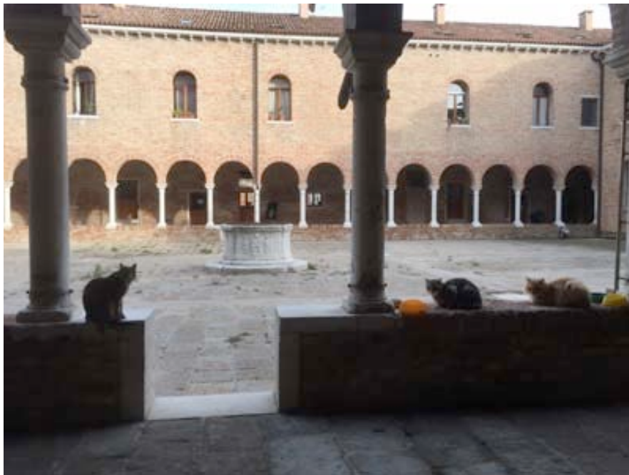
Ex Convento-Monastery di San Cosimo e Damiano