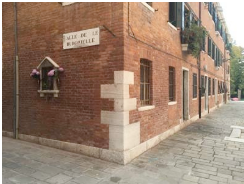
Calle delle Burchielle