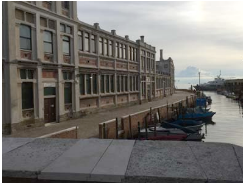
Ponte to Campo Junghans

Danish writer Hans Christian Andersen didn't like Venice. He preferred Napoli. At his time, in 1830, the bridge to Venice was not built. From the main land, Marghera, tourists had to sail with Gondola to Venice. He didn't like the Gondola, especially he didn't like the Fisola or cover. He compared it, as to sail inside a coffin.