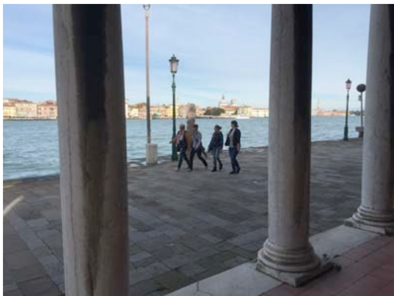
Giudecca's promenade Fondamenta di Santa Eufemia with view towards San Marco