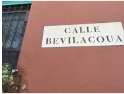
2.nd street to take after F. Pescheria