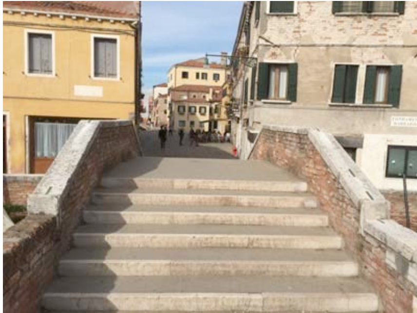
Ponte to arrive to the little park of Fondamenta della Pescheria