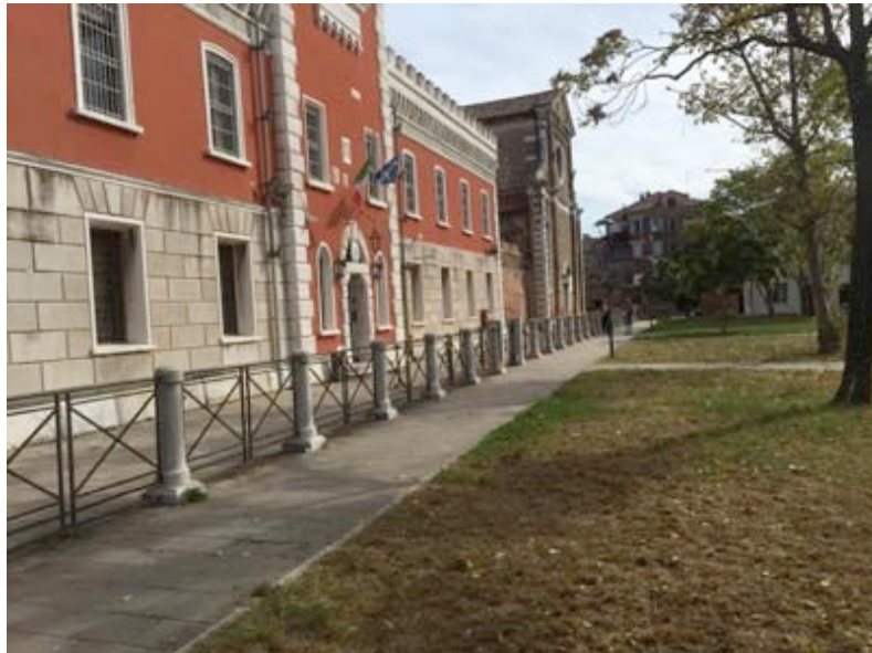
Fondamenta di Santa Maria Maggiore