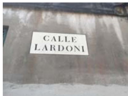
Street to take after F. Pescheria