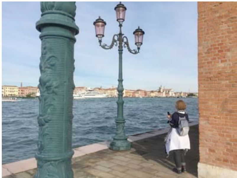
Giudecca's promenade Fondamenta di Santa Eufemia with view towards San Marco

When in Giudecca, you can promenade freely, it is very small, beautiful, more calm and different than the "main land".