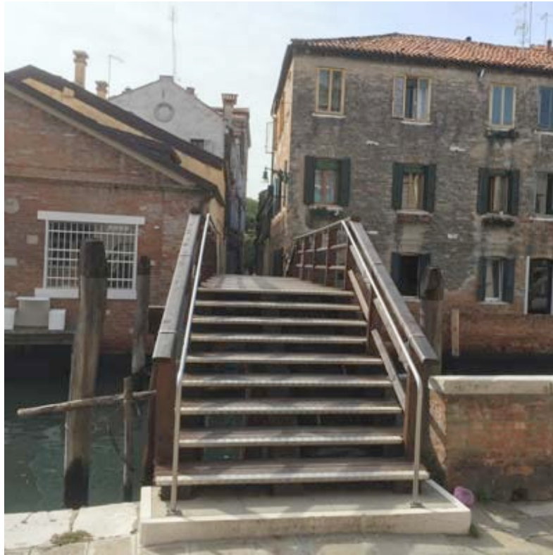
Ponte to Calle della Madonna