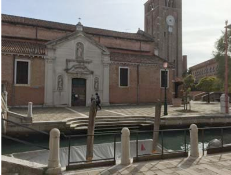
Chiesa di San Nicoló dei Mendicoli .

Visit this church, it's very beautiful. Find out the opening time. Probably mostly on the morning.