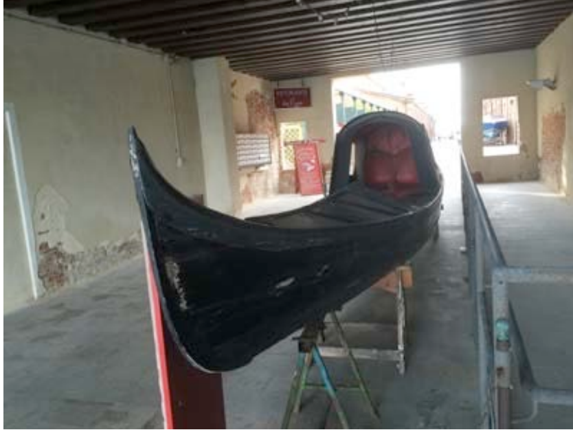
An old Gondola with the Fisola or Cover

A bit of story of the Gondola with the Fisola or Cover.