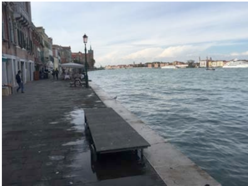
Giudecca's promenade Fondamenta di Santa Eufemia with view towards Dorsoduro