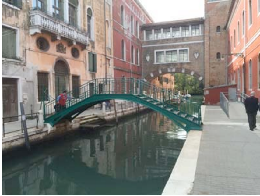
Turn right to Fondamenta dei Tabacchi and go over the bridge