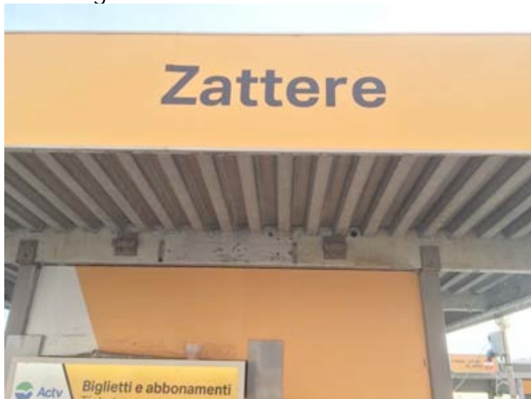
Stazione del Vaporetto, Ferry Stop Zattere to the island of Giudecca