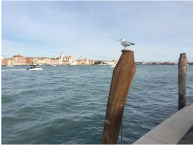
Giudecca's promenade Fondamenta di Santa Eufemia with view towards San Marco