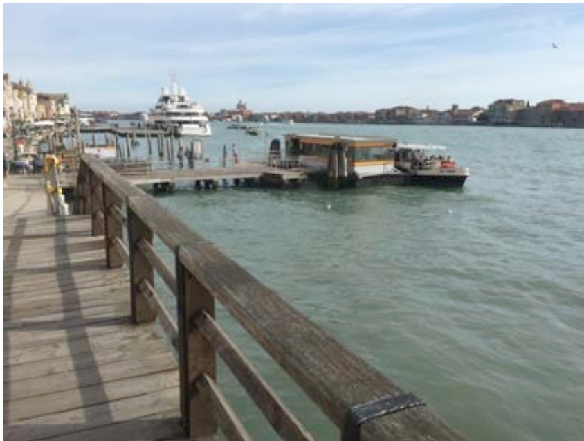
Ponte Longo and Harbour of Canale della Giudecca