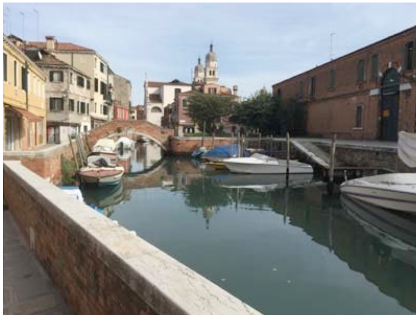
Fondamenta Lizza to the little park of Fondamenta della Pescheria

Visit this church, it's very beautiful. Find out the opening time. Probably mostly on the morning.