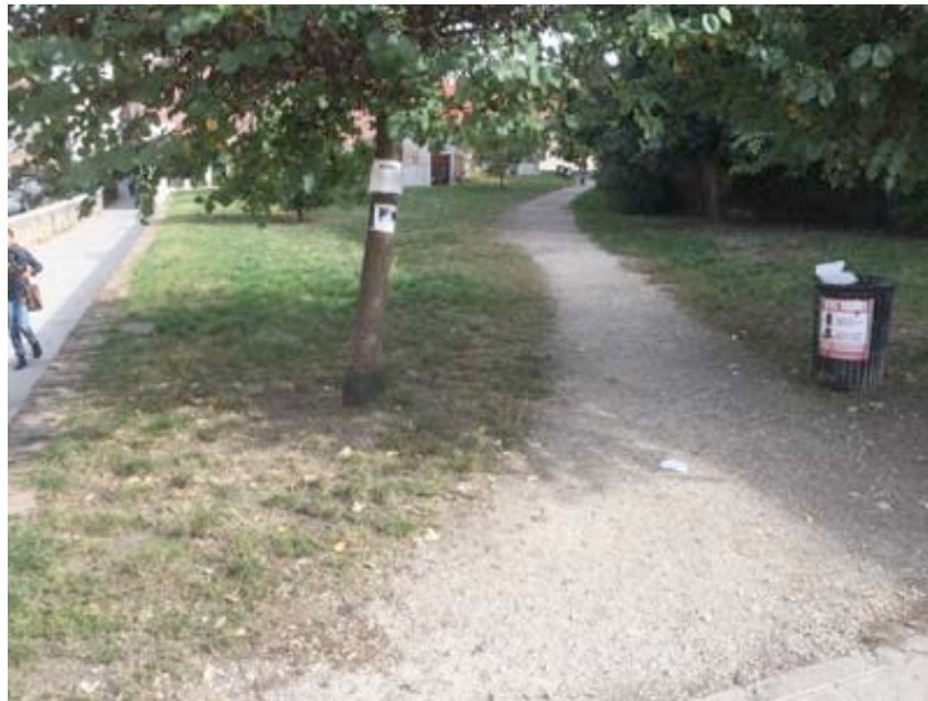
Fondamenta della Pescheria