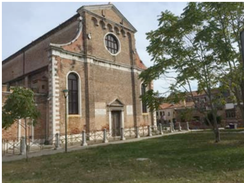
Chiesa di Santa Maria Maggiore