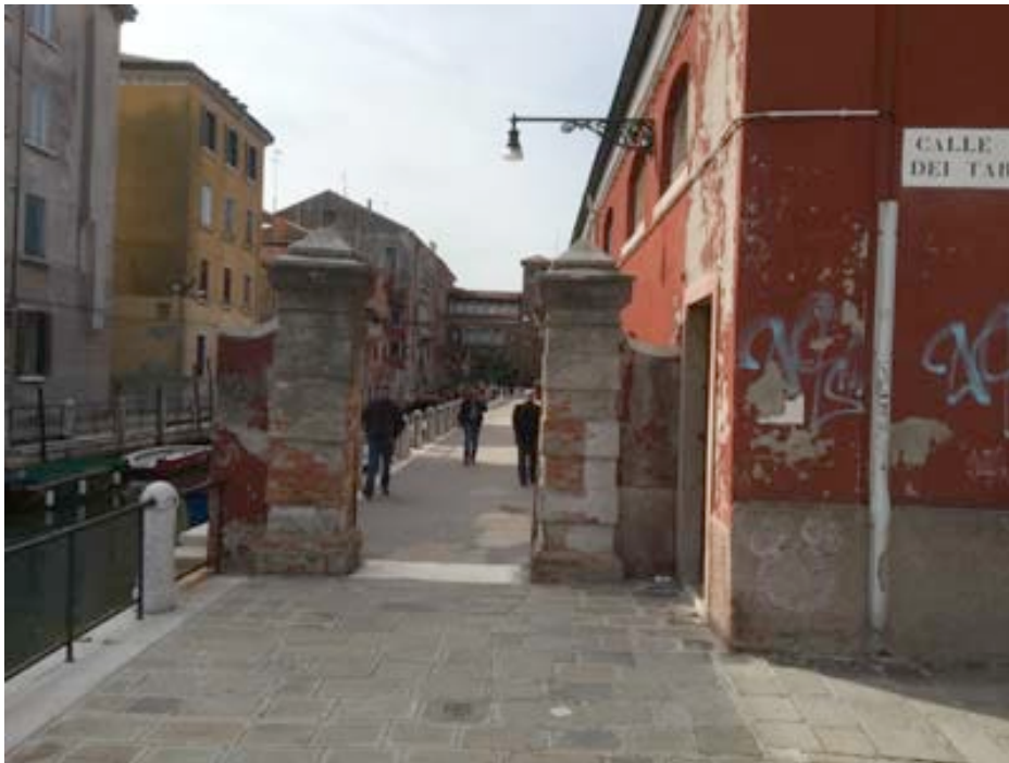
End of Calle Nuova dei Tabacchi